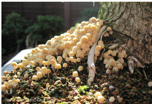
Fungi growing at the foot of an English elm bonsai