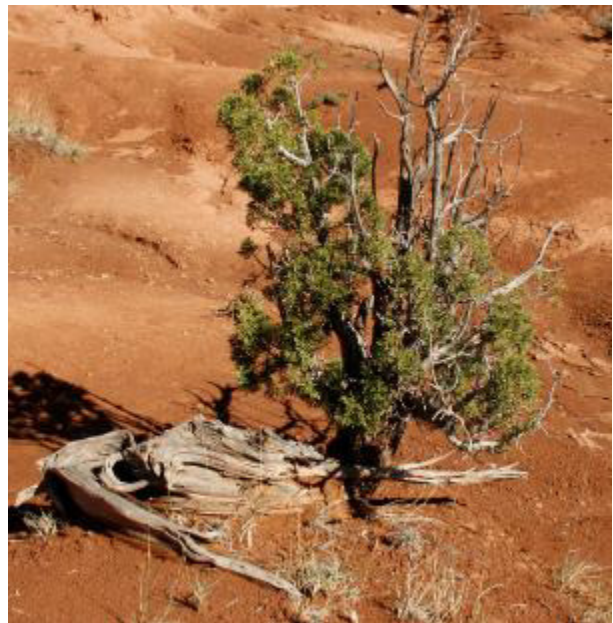
Would you qualify as carry-on luggage?