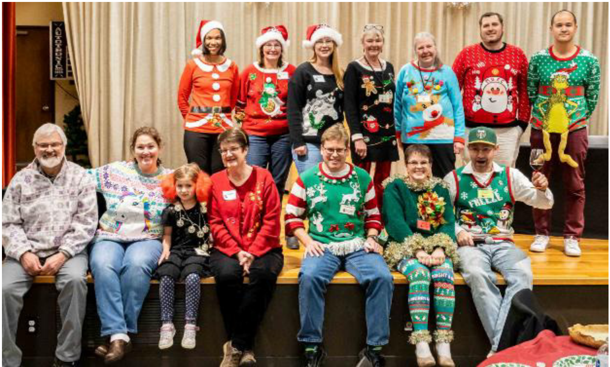
Ugly sweater contest with a clear winner in all green with gold trim.