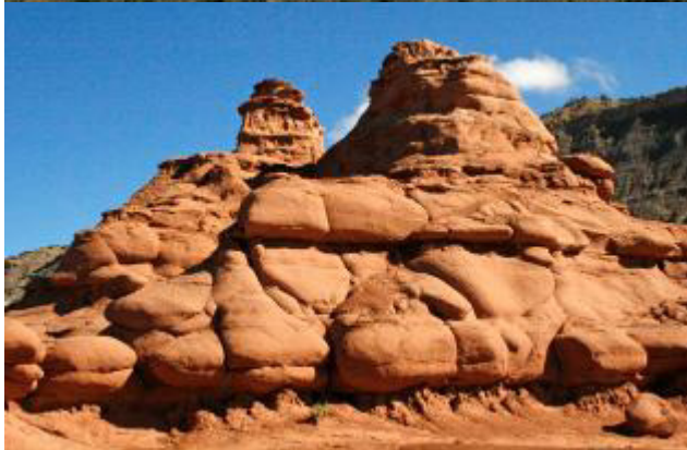
Hoodoo formation up top.

Kodachrome Basin is home to more sandstone formations, but it has portions of harder rock. So not only do you get the hoodoos that occur in Bryce, but you get these formations they call pipes rising from the softer sandstone. They were usually white and cylindrical in nature. There are a full 70 of these pipes that rise up to 170 feet in the park and as stupendous as they were, my full attention, or at least 90% of it was on the trees. My wife Lisa said, you can't take pictures of all of them, but ahhhh, I can try! But more about that in a minute.