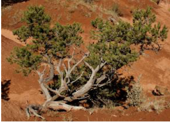
Pinyon Pine hanging out