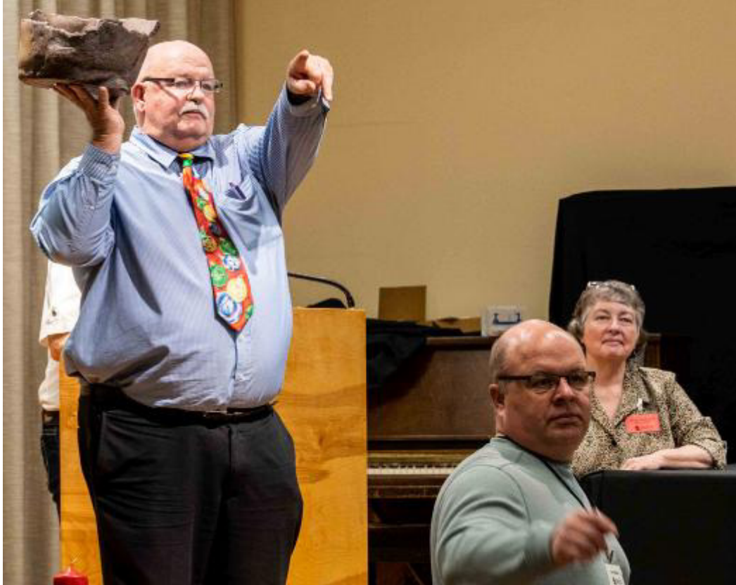
Lots of great pots and trees were auctioned. People got great deals.