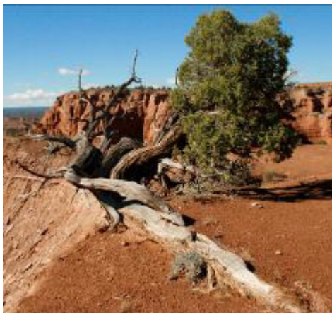
Cliffside Utah Juniper