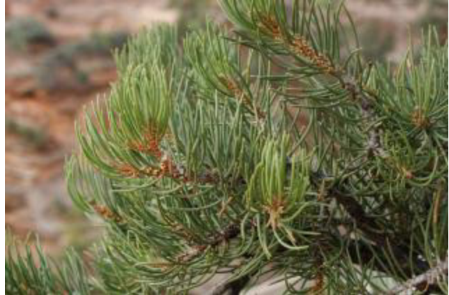
Pinyon Pine foliage