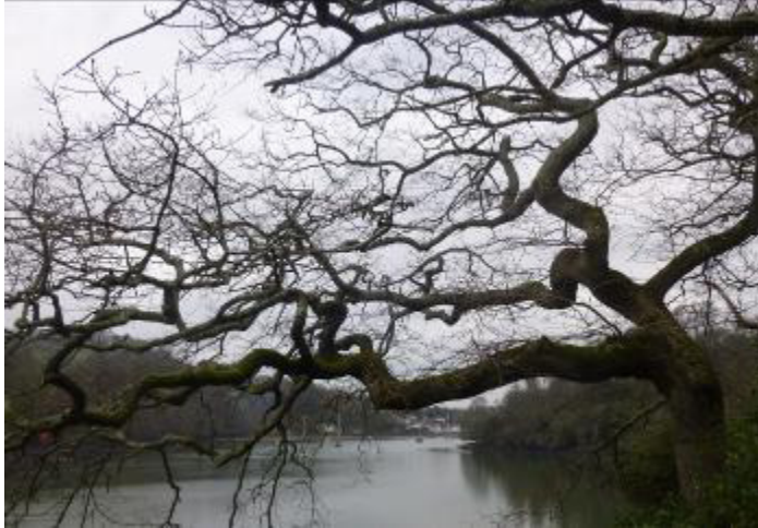
Branch structure over the river below Agatha Christie's Summer house.