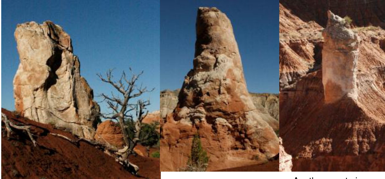
My favorite pipe. Note the stark contrast between the white of the pipe and red sandstone of the soil. The trail is at the base of the dead pinyon pine.