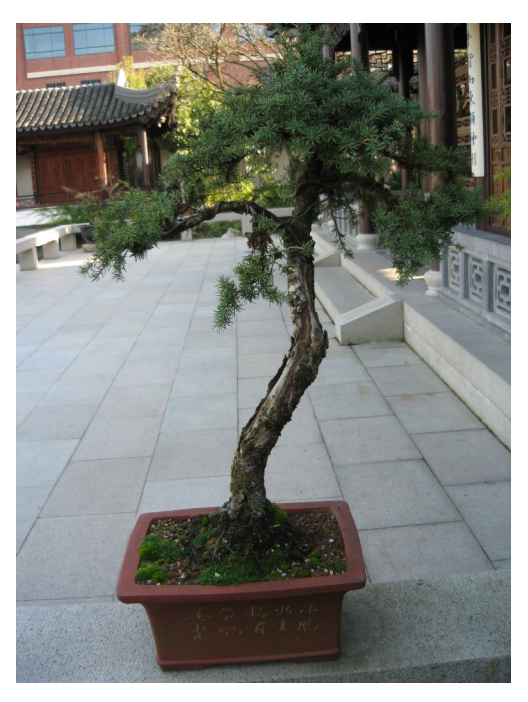
Gracing a Buddhist temple.