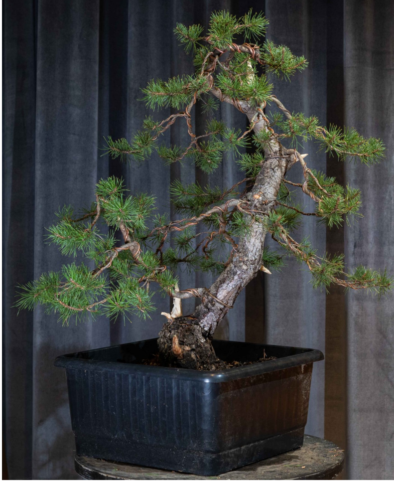
The tree styled by Mauro Stemberger went to the winning lottery number.