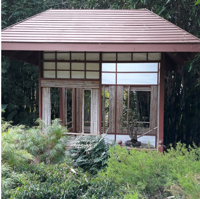
Teahouse located in the San Diego Botanical Garden, Encinitas, CA