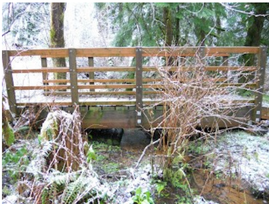
Tillamook State forest blog

January Haiku Wind and snowflakes play Tonight temperature drops Winter's here to stay Ron Yasenchak