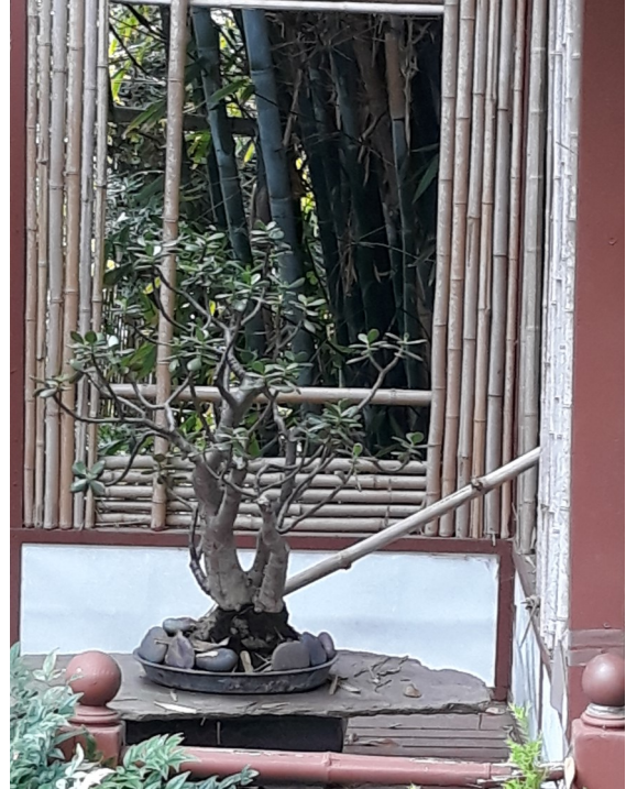
Jade bonsai displayed in the Teahouse