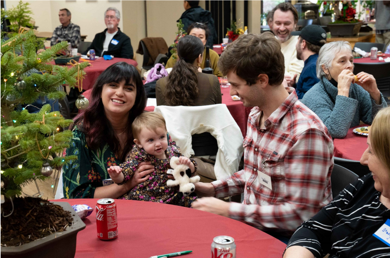
Great to see newer members enjoying the festivities