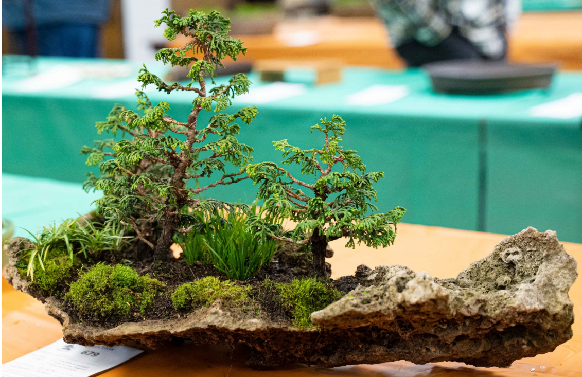
The silent auction included some real treasures.