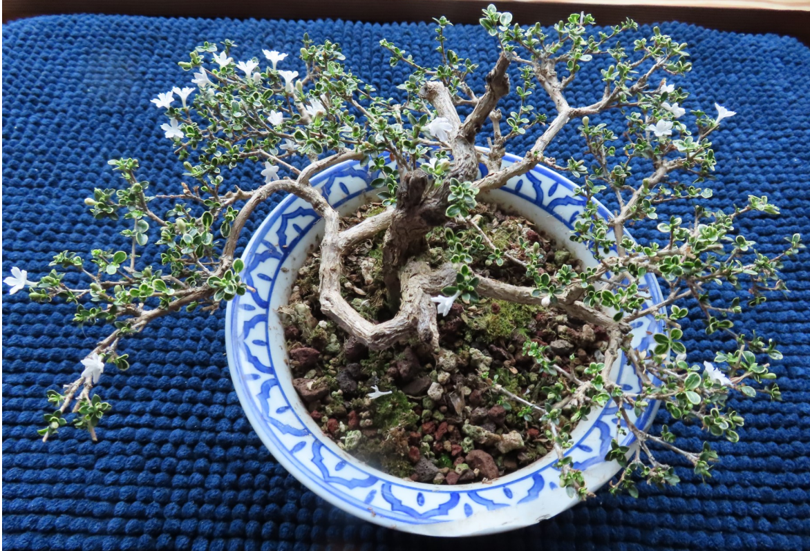
Old serissa keeps on blooming.