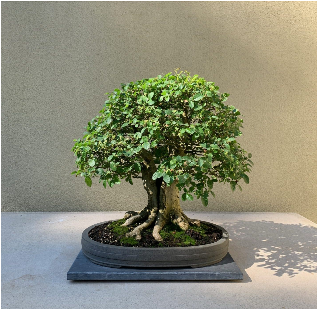
Pacific Bonsai Museum