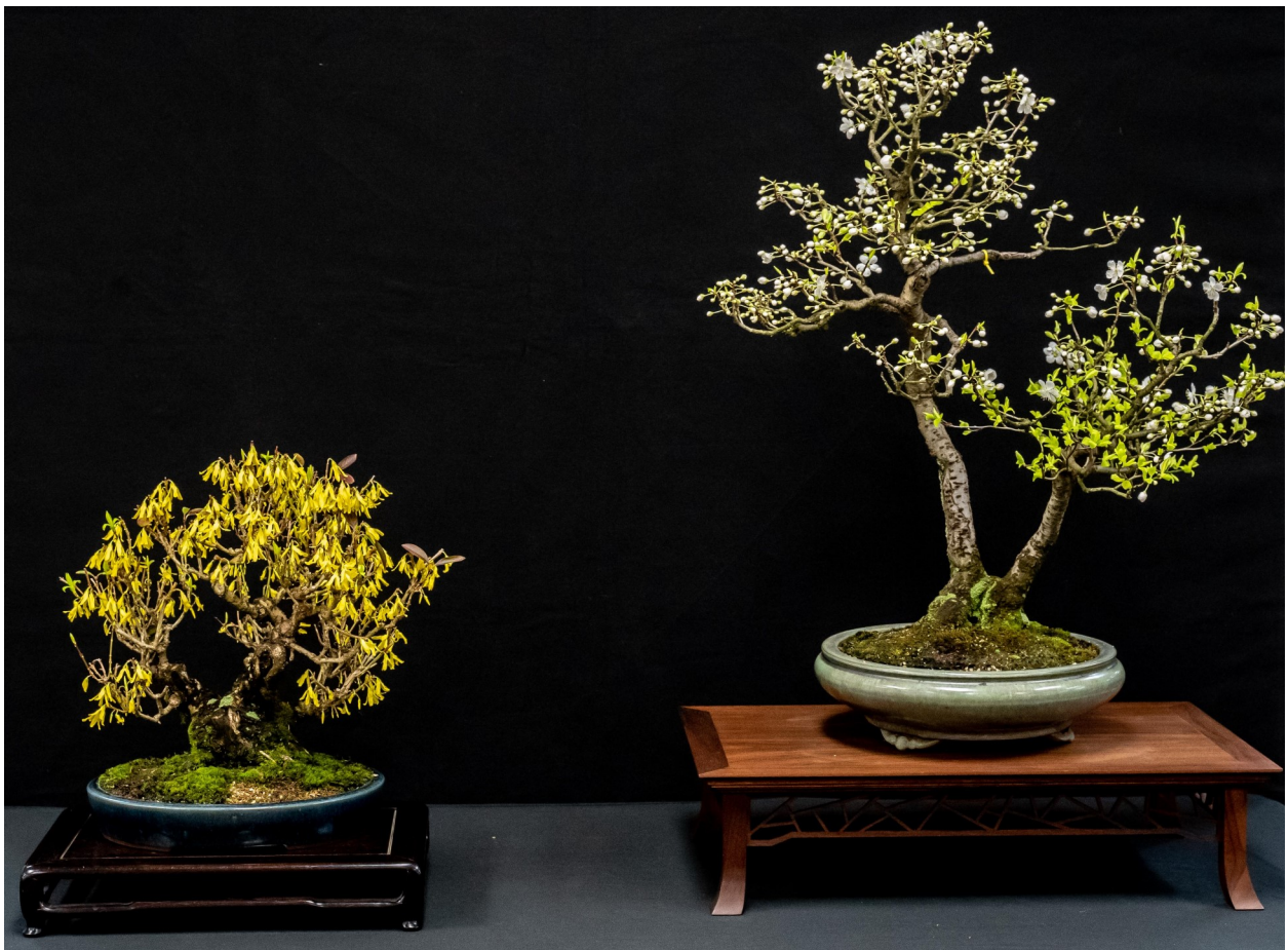
Our Monthly Display with two magnificent specimens in full bloom.