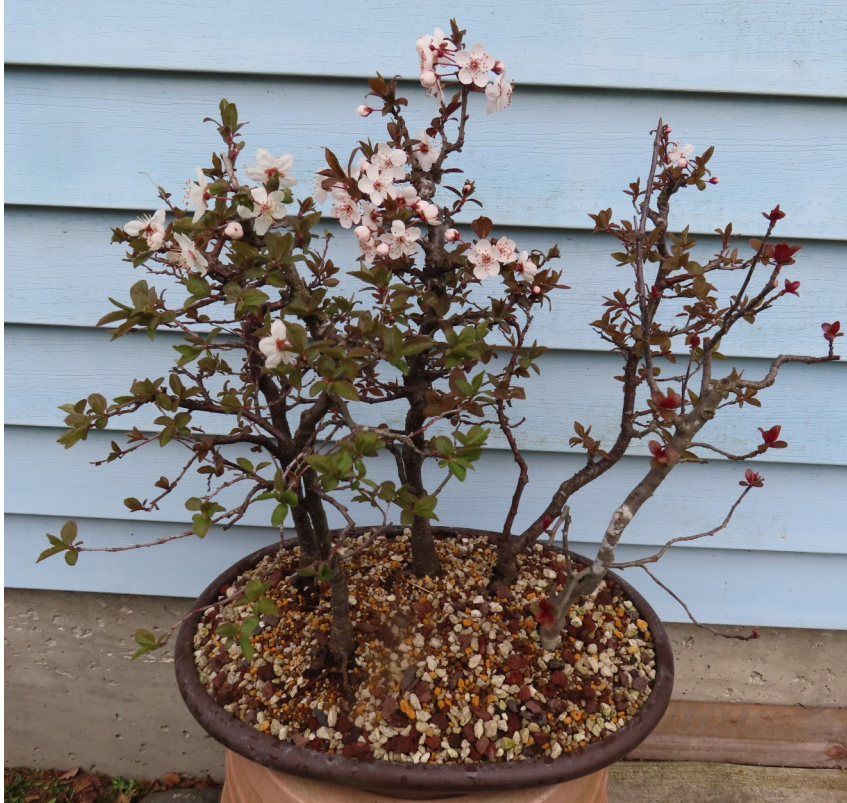
Purple plum, Prunus cerasifera , grove in bloom. Includes a crab apple, Malus , with redder leaves.

See pussy willows January to April Vary like bonsai