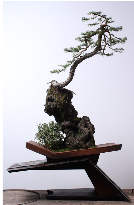
Avant Garden Doug Fir

Mallards wandering Looking for perfect nest site Like finding the front