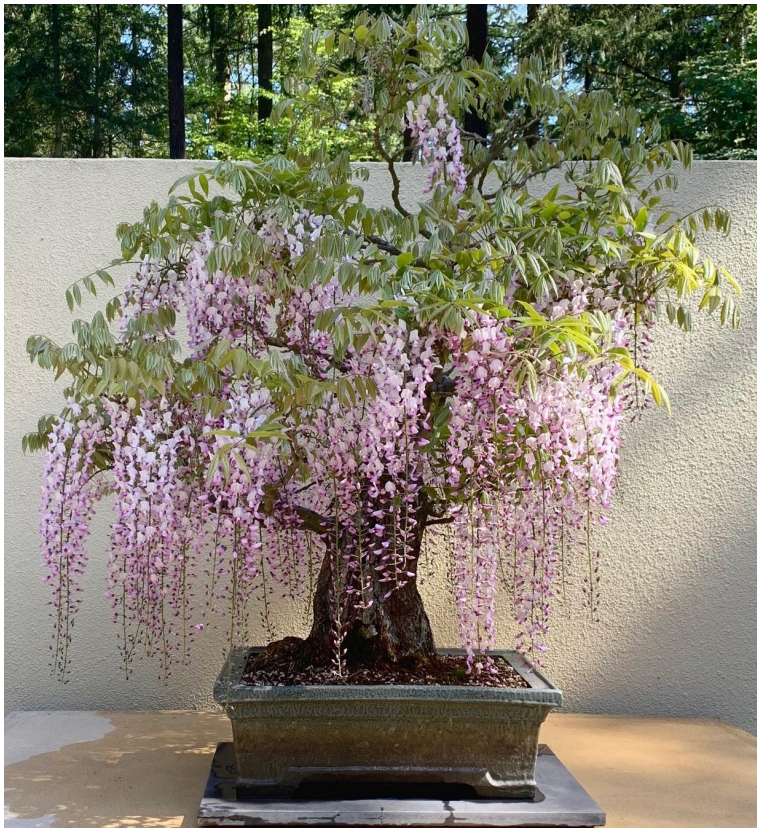
Percy Hampton's Japanese wisteria

Step inside the Avant-garden of bonsai where anything is possible, and be inspired! Exhibition runs May 13 to Sept 10, 2023.