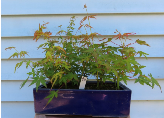
Time to get to work!