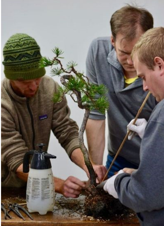
Styling a Shore pine.