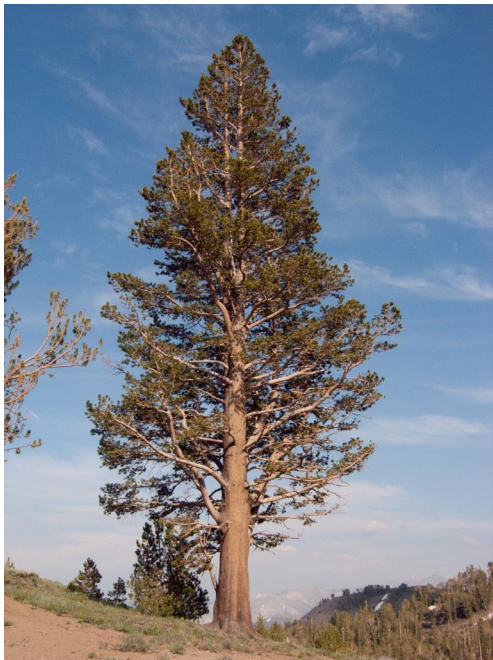
Pinus Contorta murrayana , Sonora Pass, CA