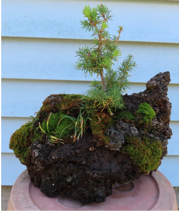
Difficult season for a mountain hemlock living on a rock.

FREE: 30' bamboo cane, you haul 503 704 3891