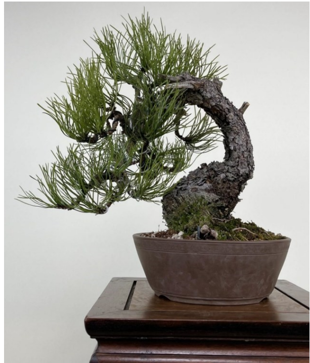
Kyodai Bonsai pine

Sun intensity Branches extend and leaves unfurl Watch those internodes