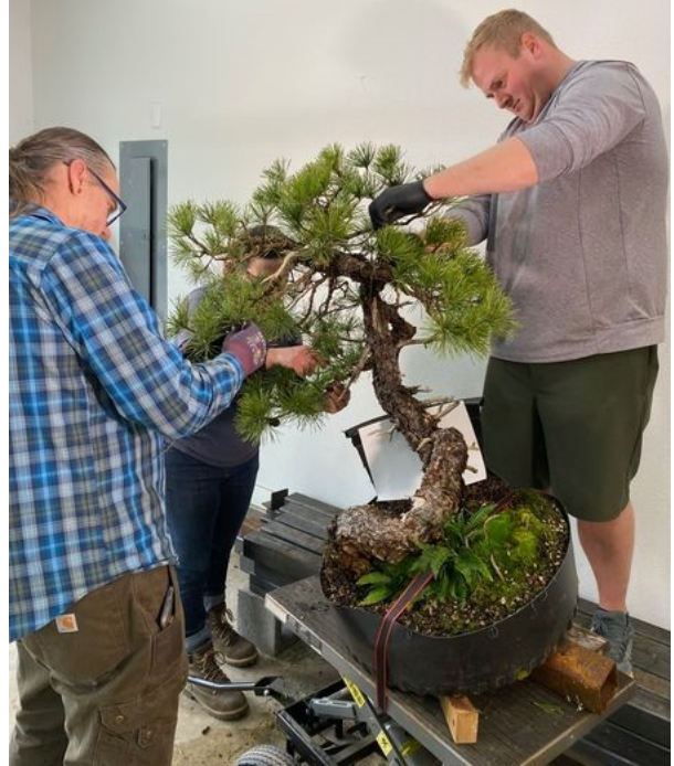
Styling a Lodgepole pine.