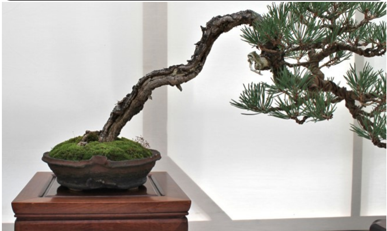
Pinus sylvestris / Scots Pine bonsai. Wirral Bonsai Society Show in Northwest England.

Bring your own trees to style in this workshop. We will cover how to grow and style multi and single flush pines, including Japanese Black and White, as well as our own native pines. Limited to 5 students.