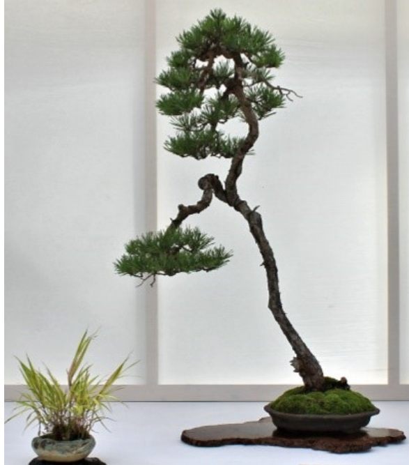
Pinus sylvestris/Scots Pine literati bonsai Wirral Bonsai Society Show in Northwest England.