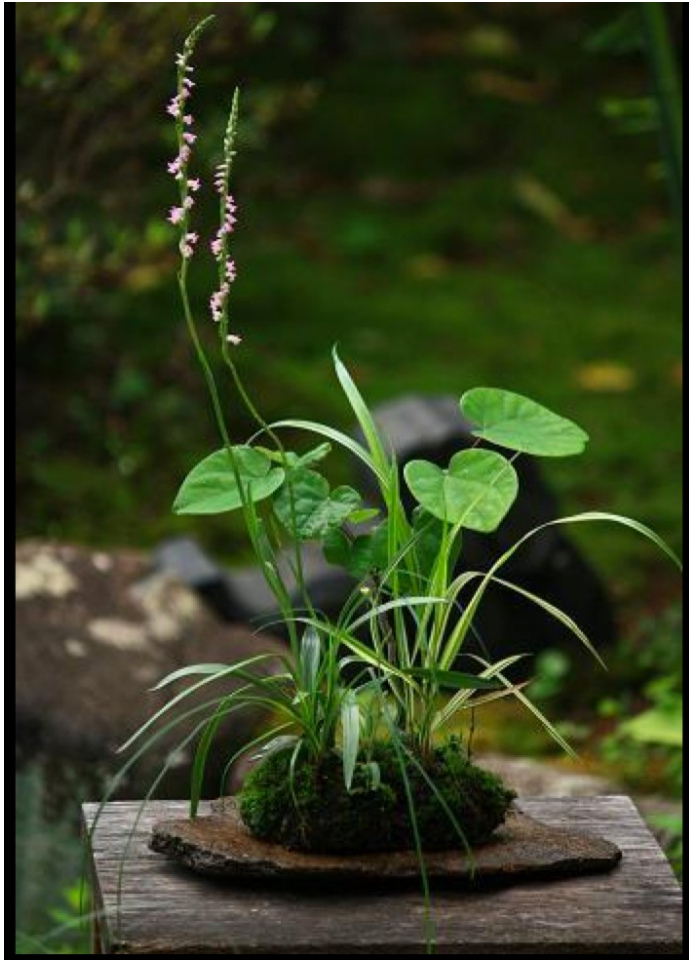
Mossball with Spiral Orchids