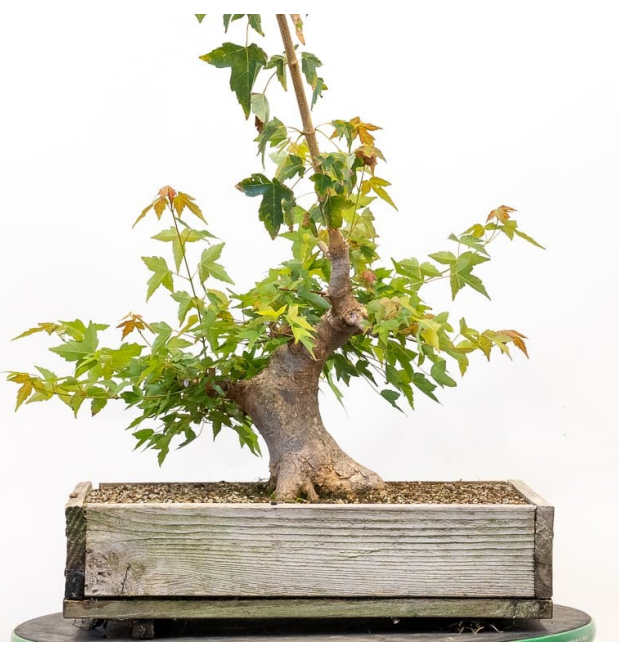
New shoots on the lower branches eight weeks later

I reduced all of the branches on the second tree, and as a result, it produced more vigorous growth along the trunk.