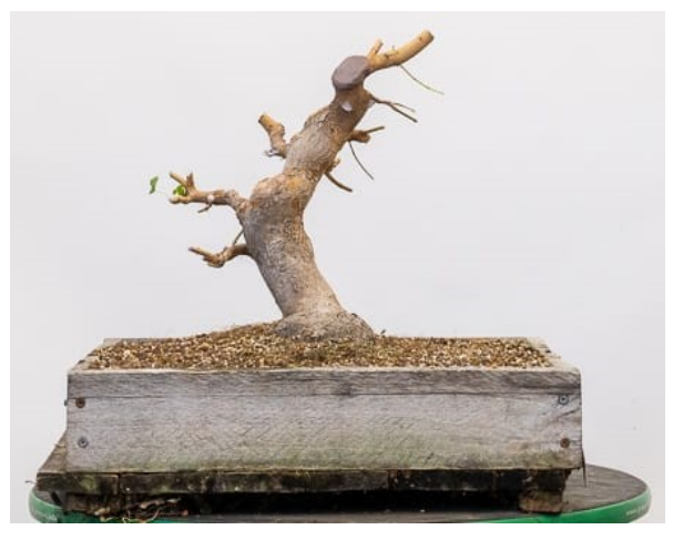
After cutback and defoliation in July

I reduced all of the branches on the second tree, and as a result, it produced more vigorous growth along the trunk.