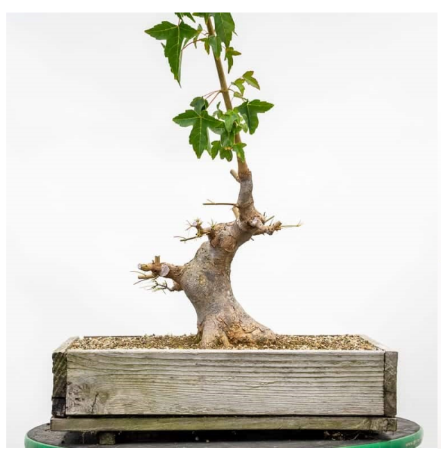
Trident maple after cutback and defoliation – July, 2020

The tree with the sacrifice branch produced a small amount of low growth, but invested most of its resources to extend the sacrifice branch which is now over eight feet long.