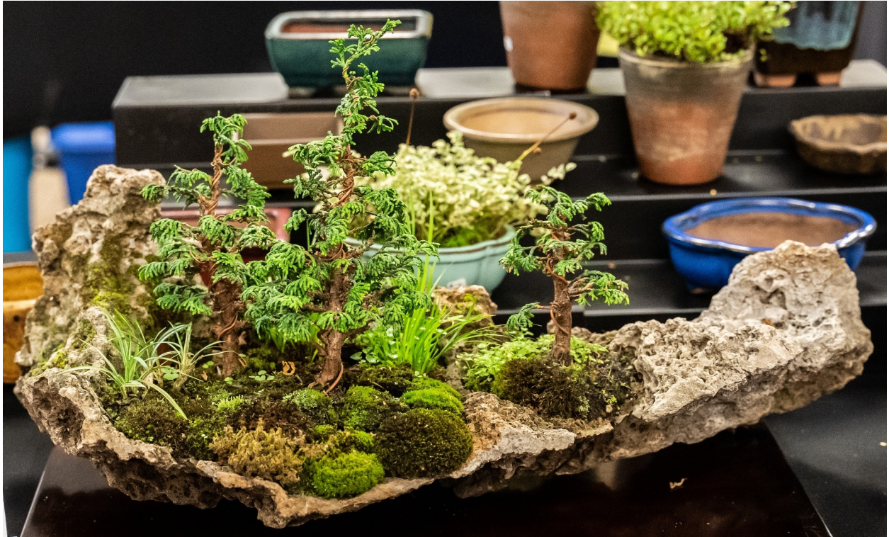
Bonsai creativity on all sides