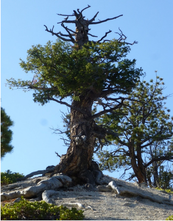
Conifer at 8100' elev. in Bryce Canyon Nat. Park