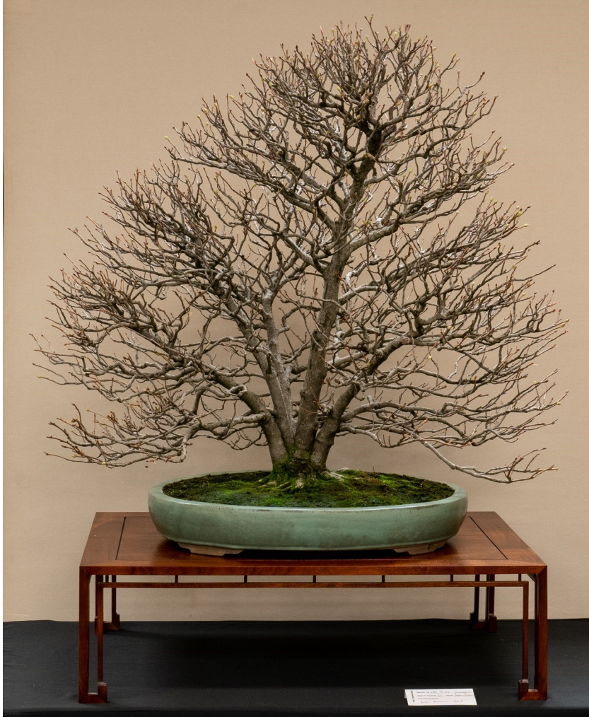
Members enjoyed viewing beautiful examples of deciduous bonsai