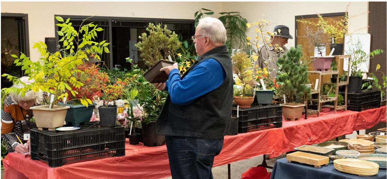
A large variety of trees, pots, tools and other bonsai necessities were available.