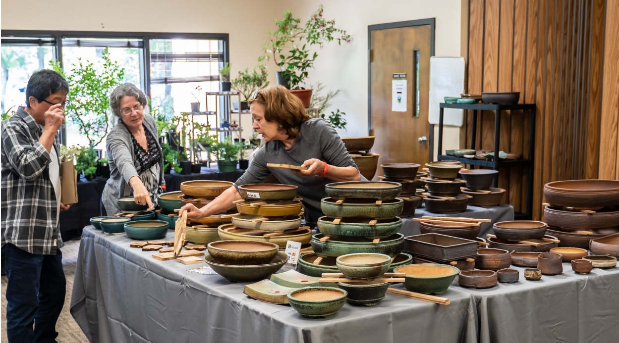
Various vendors of pots and trees