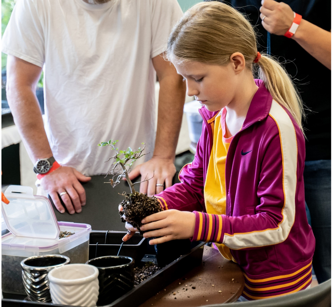
Participants ranged from newest beginners to seasoned artists