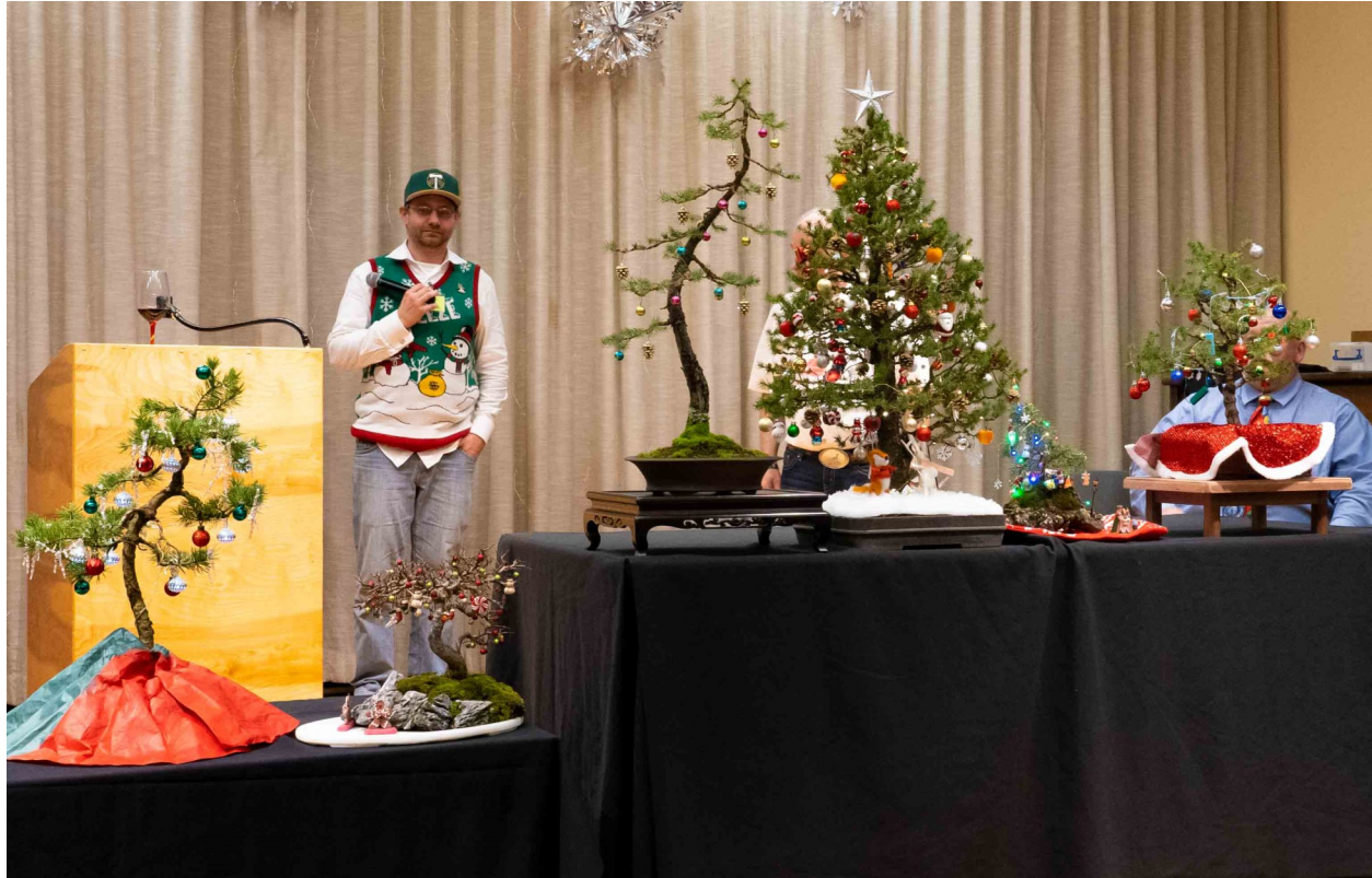
Decorated Tree Finalists at 2018 Holiday Party