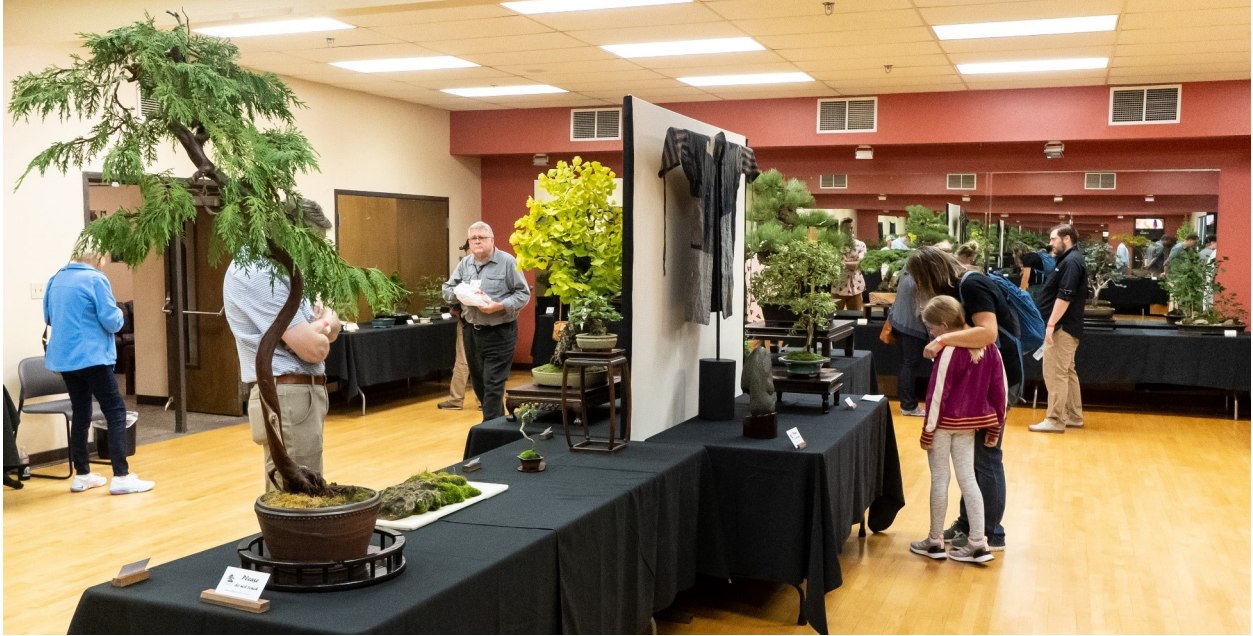
The Exhibit was large and impressive with a variety of styles and aesthetics.