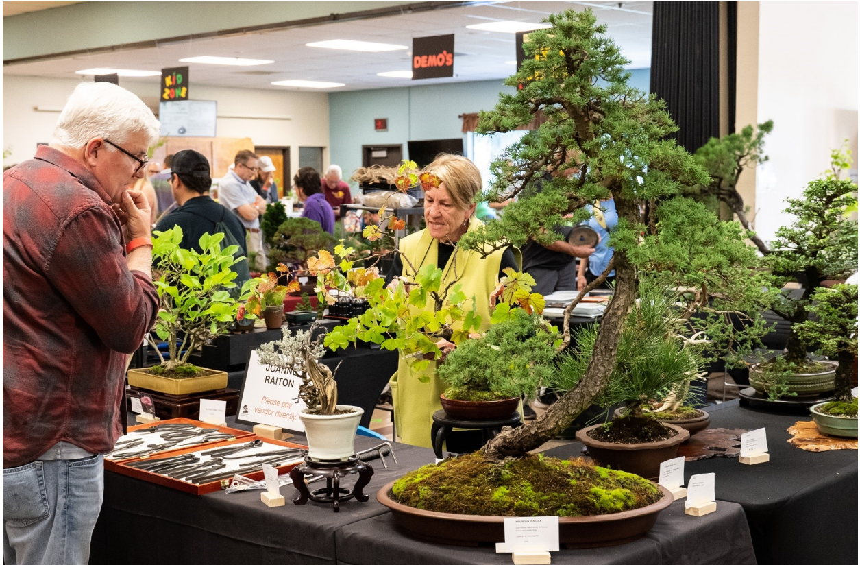
Trees for sale from raw material to high end trees like these