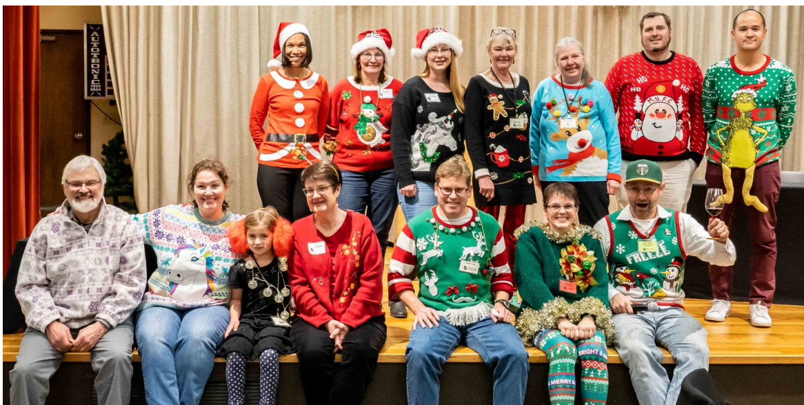
Best Sweater Contestants at 2018 Holiday Party